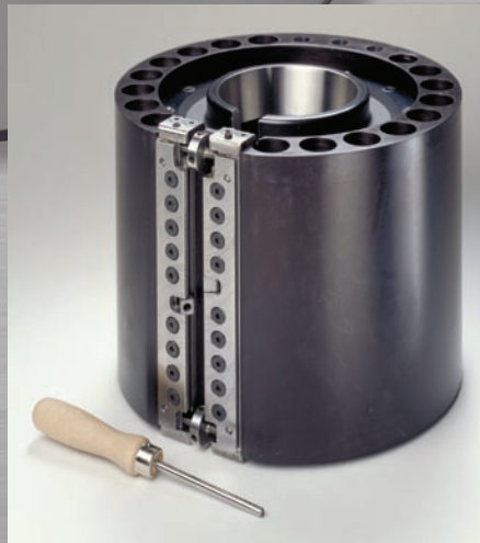
Speed clamp cylinders for waterless plates