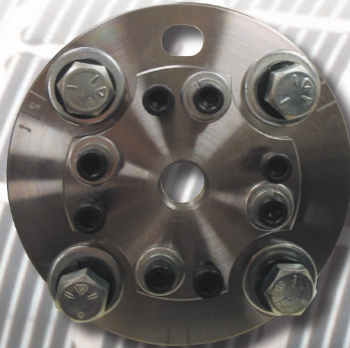
Conventional eccentric type end cap.